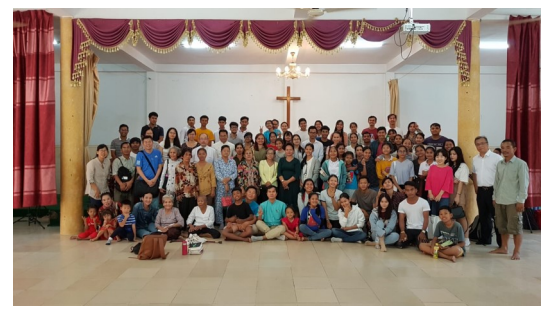
(Congregation of Faith Krang Angkrang Church)